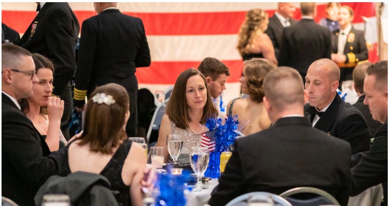
Sailors from PCU USS DANIEL INOUYE and their guests enjoying dinner.